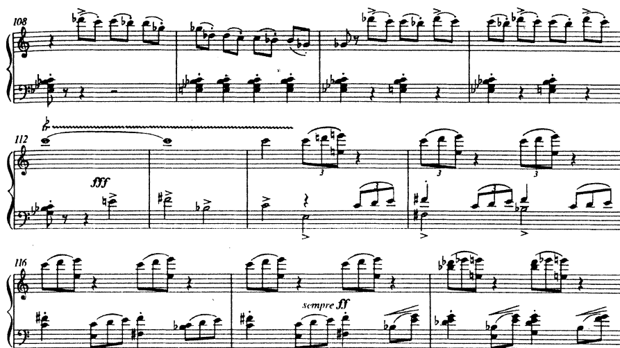
Example 4: The orchestral storm ( Christus , no. 9 “Das Wunder”)

the solo voice of Christ ( Example 5 ) after a long silence, seemingly to reflect the death symbol of the preceding music. The occasion is where the disciples, during a storm on Lake Galilee, cry out “Domine salva nos, perimus”. [Lord, save us, we perish.] The music of the storm, which brings the fear of death to the disciples, is an orchestral piece 175 bars long in no clear tonality, and with no key signature. After the disciples’ cry for help, the orchestra falls silent and there is a long pause, into which the unaccompanied voice of Christ sings “Quid timidi estis modicae fidei?” [Why are you fearful, O ye of little faith?] The orchestra then restarts, groping its way towards tonality and a key, whose signature seems to ‘be born’ before our eyes, the storm having subsided. Surely here Liszt is using the voice of Christ to bridge the gap between the ‘sans ton’ music (death) – and tonality (life). If Liszt’s thinking at these points is, as it seems to be, theological, then it gives the whole question of tonality in his work a religious foundation.